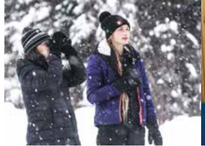
Over 80 percent of our visitors come in winter.