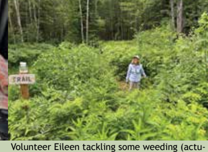
Volunteer Eileen tackling some weeding (actu-ally "ferning") in our pollinator garden.

We do not discriminate! Dogs can be Bog Buddies too! Right Lou?