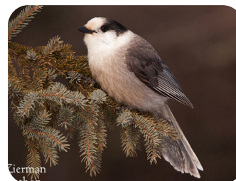
Top-scoring photo from the Photathon: Bray Jay