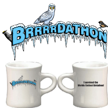
Prizes for the BRRRRDathon: "I Survived the World's Coldest Birdathon"