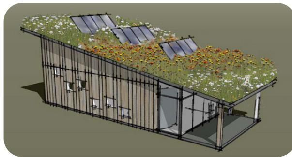
**Illustration of proposed Sax-Zim Bog Welcome Center